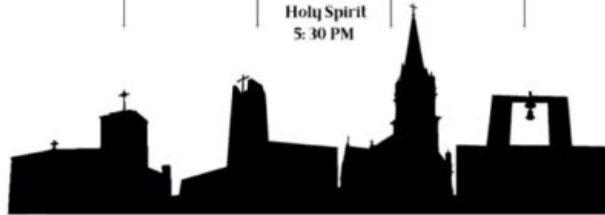
Mission Field Sacramental Schedule

For Social Media Content, Newsletter Comments, Questions, Ideas or Submissions Contact: